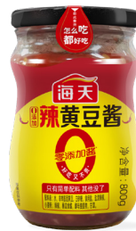
800 g GLASS