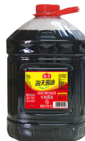
10.5 L PET