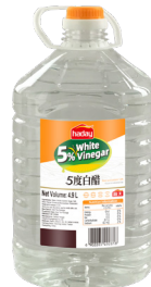
4.9 L PET