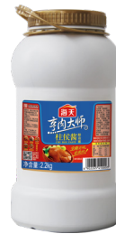
2.2 kg PE