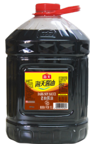
10.5 L PET