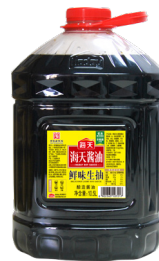
10.5 L PET