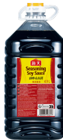
4.9 L PET