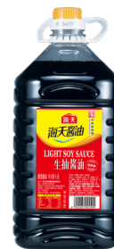
4.9 L PET