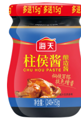
255 g GLASS