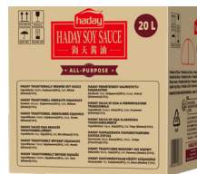
20 L BOX