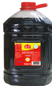
10.5 L PET