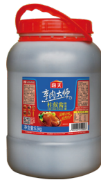
6.5 kg PE